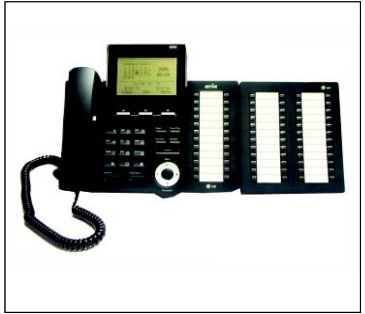
LDP7024LD-BK & LDP7048DSS